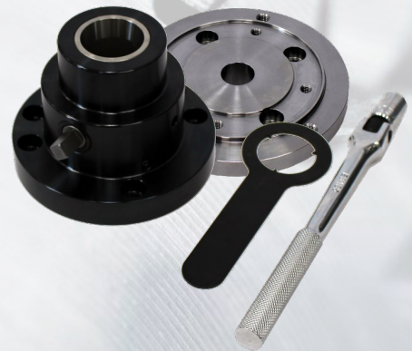
5C Manual Closer & Plate